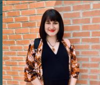
MISS EMILY ITINERANT SPECIAL EDUCATION TEACHER